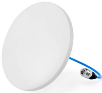
Front Isometric View