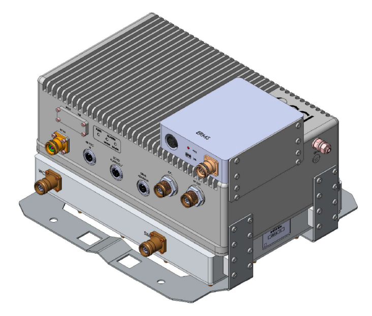
Mounting of ECHO Repeater with Diplexer and ERMS Module